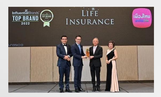
Muang Thai Life Assurance won 2 awards