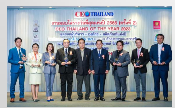
Muang Thai Life Assurance won 2 awards