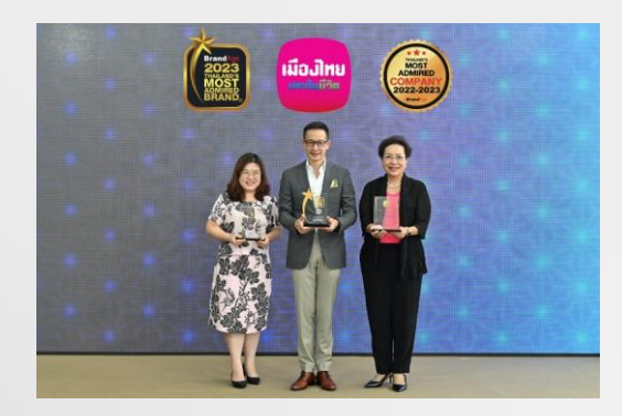
Muang Thai Life Assurance won 3 awards