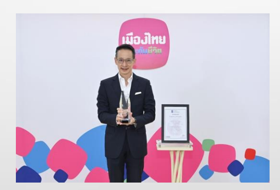
Muang Thai Life Assurance won 2 awards

hosted by BUSINESS+ Magazine & University of the Thai Chamber of Commerce