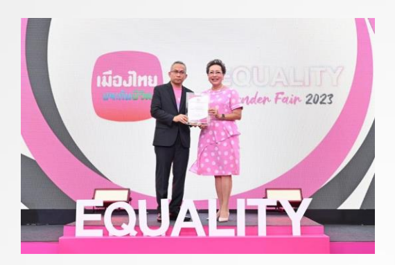
Muang Thai Life Assurance received Gender Equality Promotion Organization

hosted by the Economic Reporters Association, joint committee of 3 private sector institutions & University of the Thai Chamber of Commerce